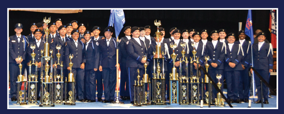
Left: The Mustangs, John Jay High School, San Antonio TX - Alternative Arms National Runners-up; Right: The Blue Aces, Brandeis High School, San Antonio TX - Unarmed National Runners-up

1st Place - Springboro High School (OH-081)