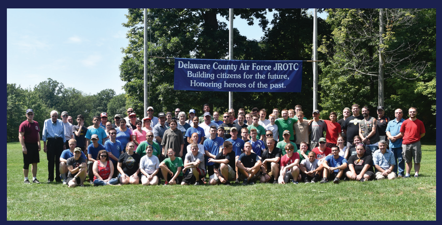
Every decade in OH-012's history was represented at their 50th Anniversary Celebration.

Delaware County Air Force Junior ROTC Unit OH-012 recently marked its 50th Anniversary, as well as the 50th Anniversary of the entire AFJROTC program. The program was inaugurated in 1966 with the activation of 20 pilot units scattered throughout the United States, one of which was Unit OH-012 based at Rutherford B. Hayes High School in Delaware, Ohio! Of the original 20, 12 are still active, making OH-012 one of the 12 oldest units in a program that now numbers 878 units worldwide!