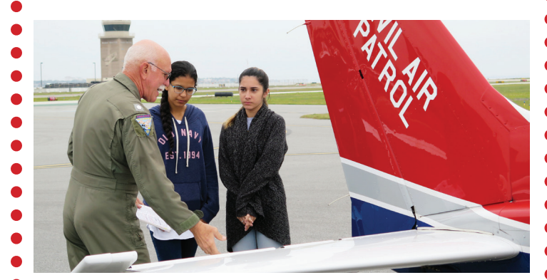
Cadets perform pre-flight checks with CAP pilots.

Cadets from Jefferson High School (FL-20054) receive a preflight briefing from local Civil Air Patrol (CAP) pilots.