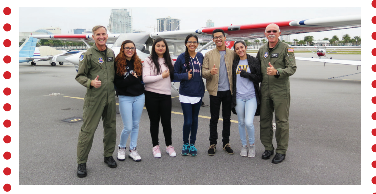
Cadets and CAP pilots pose in front of the aircraft before flight.