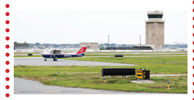
CAP aircraft prepares for take-off from an airport in St Petersburg, FL, where the first ever scheduled commercial flight took place.